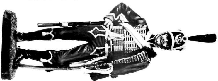
RC110-8 FRENCH HUSSAR, 1808

The Emperor of France is portrayed here in his traditional uniform of the Chasseurs à Cheval. A squadron of Chasseurs always accompanied Napoleon on service as an escort.