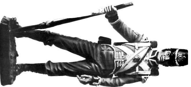
PRIVATE, FLANK COMPANY, 3rd FOOT GUARDS circa 1815 At this date there were only three regiments of Foot Guards, whose flank companies (Grenadier and Light companies) wore distinctive "wings" on their shoulders. At Waterloo the flank companies assumed the defence of the Chateau of Hougomont, which they held throughout the battle.