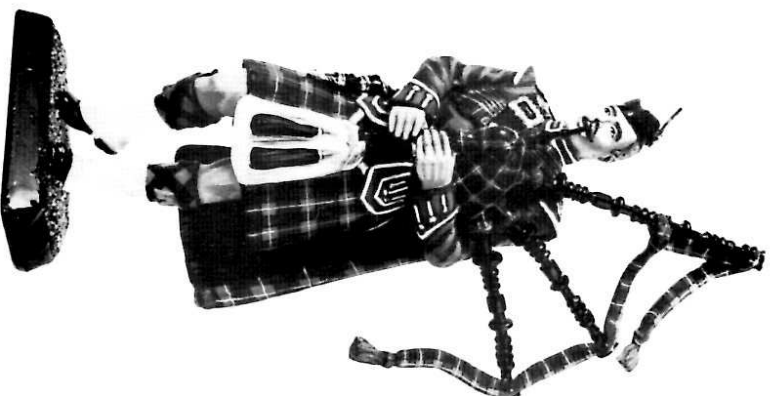
RC110-13 PIPER, THE GORDON HIGHLANDERS c. 1910

This figure may be used to portray any of the fourteen regular regiments of French hussars as well as many of France's Allies. The hussars found fame and fortune under such great light cavalry leaders as Murat, Lasalle and Marmont.