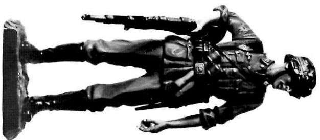
RC110-5 GERMAN PANZER N.C.O., 1940

TRADITION 110mm FIGURES ARE CAST IN QUALITY WHITE METAL AND ARE AVAILABLE FULLY HAND-PAINTED OR IN KIT FORM COMPLETE WITH PAINTING INSTRUCTIONS