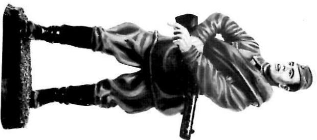
RC110-11B RUSSIAN INFANTRY PRIVATE, 1943 (WEARING CLOTH SIDE CAP)