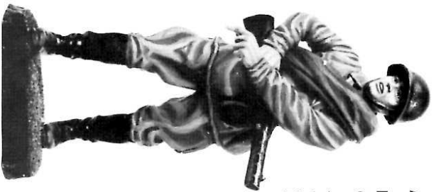
RC110-11A RUSSIAN INFANTRY PRIVATE, 1943 (WEARING HELMET) The scourge of the Eastern Front, the infantryman was the backbone of the Russian Army. His continual stamina, fortitude and determination to win, eventually broke the German resistance on the Eastern Front.